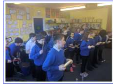
P7 enjoying the Samba Workshop

Staff have been busy working on the children's annual reports. The reports will be sent home on 18 th April. We will hold parent consultations on 26 th and 27 th April. A letter with details of appointment times will be sent to you nearer the time.