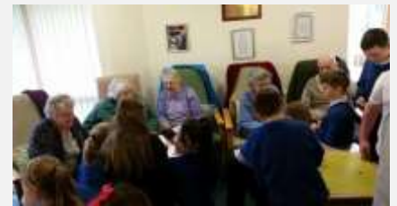
Community Group entertain residents at Hanover Court